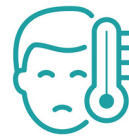
Pain & Fever